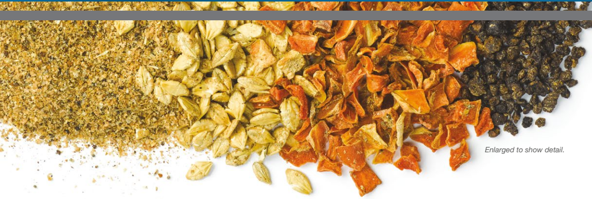
Enlarged to show detail.