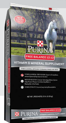
NET WT. 25 lb (11.33 kg)

For horses who are not receiving a balanced concentrate feed, the highly palatable Purina® Free Balance® 12:12 Vitamin & Mineral Supplement provides the added vitamins and minerals needed to balance a pasture or hay-only diet. Purina® Free Balance® 12:12 is also available in a 40-pound block.