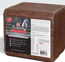
NET WT. 40 lb (18.14 kg)